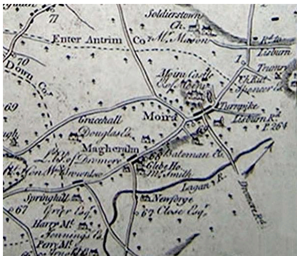
1777 map showing the castle and possible lough

According to Bassett's History of Co. Down, frogs were first discovered in Ireland at Moira, probably in those magnificent botanical gardens. Records describe this mansion as a "commodious habitation, surrounded by a wood, which affords beautiful walks, a large lawn extends in front, where sheep feed, and is terminated by trees, and a small Lough eastwards; the rear of the castle grounds contains a wood, with large opening fronting the castle, which forms a fine perspective." Arthur Rawdon became known as the "Father of Irish gardening."