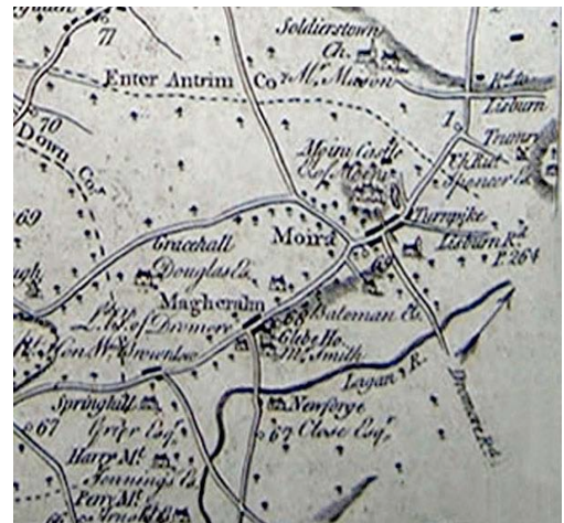
1777 map showing the castle and possible lough.

We are fortunate to have several other descriptions of the Castle grounds. One writer in 1774 is described as writing “with luxurious fancy upon the vegetable wealth, the horticultural beauty, the botanical attractions and the tasteful and intricate disposition of the gardens and parks of Sir John Rawdon’s demesne.” (Parliamentary Gazetteer of Ireland 1846. Page 781.)