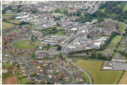
The Fort at Claremont