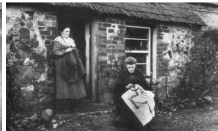
Linen industry in Moira