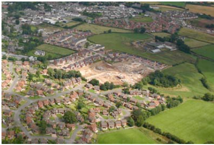
Pretty Mary's Fort

Growth in population and the ensuing development of the land over the years has left little to remind us of early life in this area except for the numerous earthen raths in and around Moira. The best preserved example and perhaps most visible is the Rough Fort on the Old Kilmore Road. The Green at Claremont is all that is left of another of these ring forts. One close to the quarry on the Lurgan Road has long since been levelled. The rath in the town-land of Aughnafosker, just behind Glebe Gardens, is called Pretty Mary's Fort. It is a good specimen of a multi-vallate ring-fort or a fort with many ditches. 3