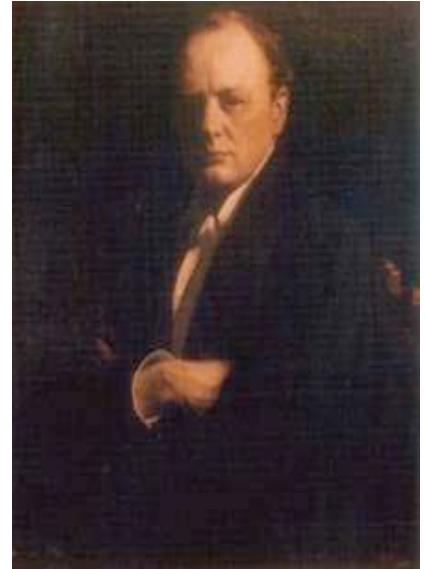
Churchill in 1915 by Sir John Lavery

Today his paintings are very valuable. One sold in 2008 for almost half a million pounds but there are seven more expensive paintings by Lavery!